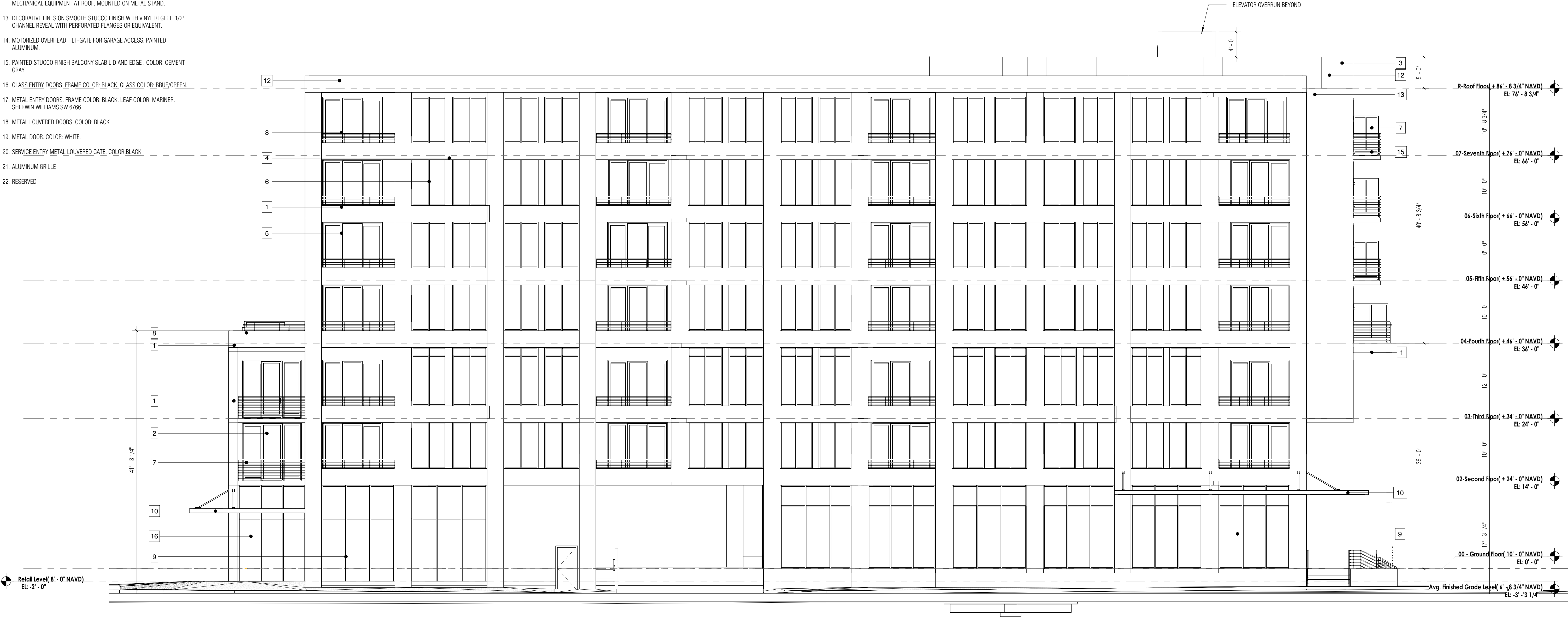
1 03 OVERALL SOUTH ELEVATION A - 09 Scale: 1/8" = 1'-0"

GLAZING NOTE: ALL GLAZING TO BE TRANSPARENT AND OF LOW REFLECTIVITY TO ALLOW VIEW OF HUMAN ACTIVITY WITHIN THE BUILDING.